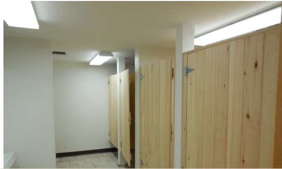
Brand new bathrooms in the lower level of the Lodge.