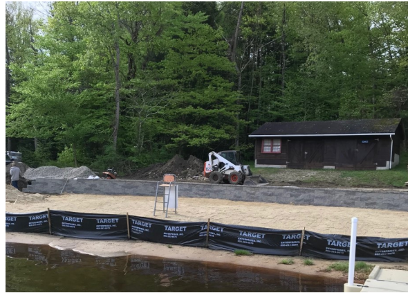
New retaining wall recently installed at the beach and made possible by the Draper Foundation Fund at the Northwest Connecticut Community Foundation.