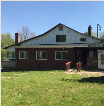
The Lodge Before