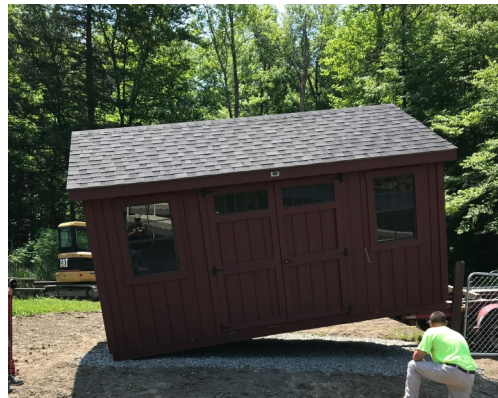
Putting in place the new shed at the waterfront.