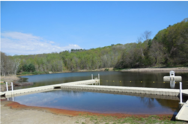
New docks that do not have to be removed and stored at the end of the season thanks to the Draper Foundation Fund at the Northwest Connecticut Community Foundation.