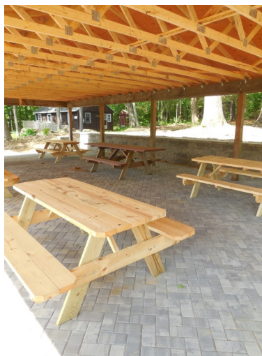
At left, a newly-roofed pavilion with a paved surface and brand new picnic tables is all set for an outdoor activity or a barbecue!