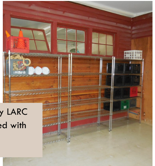
New shelves assembled by LARC staff and ready to be filled with campers' lunches.

Bender Kitchen and Baths Boe Studios Essex Winair Harwinton Drilling & Engineering Co., Inc. O&G Industries, Inc. Progressive Paving Sunrise Excavation Supreme Industries Thomaston Comfort Controls Zaharek Landscaping