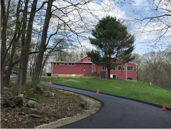
Newly-paved road heading up to the Lodge, made possible by Torrington Savings Bank.