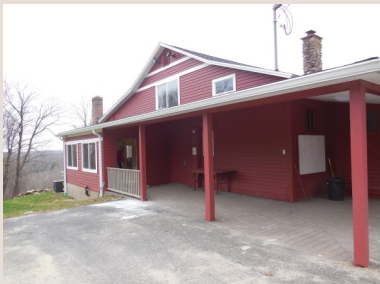
The Lodge After

Campaign Celebration Saturday, September 29, 2018 at Camp MOE. Stay tuned for further details!