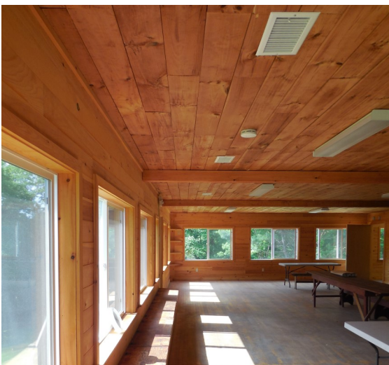
The Lodge is nearly brand new! What you can't see is new wiring, plumbing, and insulation! What you see is a bright, spacious, and beautiful building inside and out thanks, in part, to a donation from the Seherr-Thoss Charitable Trust.