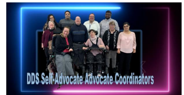
Self-Advocate Coordinators lead advocacy activities across their region which include encouraging employment!

DDS employs 10 Self-Advocate Coordinators who teach other individuals with intellectual and developmental disabilities (IDD) how to advocate for themselves. Since 2004, the self-advocacy program has created meaningful work for individuals and empowered thousands of CT residents. Self-Advocates support existing self-advocacy groups and help start new groups by providing self-advocacy and self-determination training to consumers, staff and families; and by creating self-advocacy materials that are written for and by people with cognitive disabilities. Visit our website to learn how you can become an advocate!