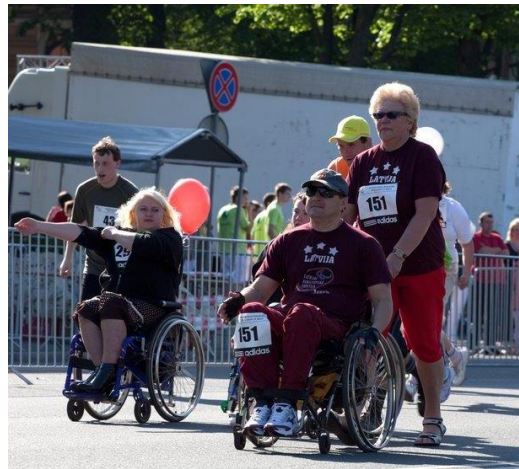
Advocates participating in a wheelchair race fundraising event.

Individuals can enroll in the Small Business Enterprise that allows individuals to identify different career paths and provides an interpersonal analysis of supports needed to be competitively employed.