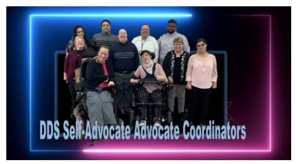
Self-Advocate Coordinators lead advocacy activities across their region which include encouraging employment!

DDS employs 10 Self-Advocate Coordinators who teach other individuals with intellectual and developmental disabilities (IDD) how to advocate for themselves. Since 2004, the self-advocacy program has created meaningful work for individuals and empowered thousands of CT residents. Self-Advocates support existing self-advocacy groups and help start new groups by providing selfadvocacy and self-determination training to consumers, staff and families; and by creating self-advocacy materials that are written for and by people with cognitive disabilities. Visit our website to learn how vou can become an advocate!