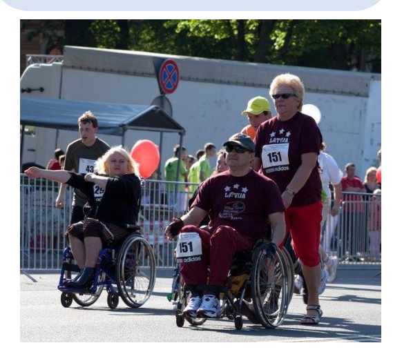
Advocates participating in a wheelchair race fundraising event.

Sometimes the road to employment is not a standard path. Project Search is a business-led program in which interns learn relevant marketable skills for 9 months. This on-site training follows a rotation so individuals may gain multiple skills within the business site. Partnerships include Mohegan Sun, Charlotte Hungerford Hospital and a host of other businesses across CT.