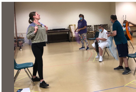
Movement workshop at the Warner Theatre

The Day Support Option (DSO) provides stimulating activities for 40 individuals. Some of the opportunities provided are morning and afternoon social coffee hours, gentle stretching and chair yoga, music and art therapy, current event discussions, bingo, weekly sing along with a professional musician, and a variety of educational and arts & crafts activities. Walks at the Torrington Armory or on nature trails, visits to local parks, and other excursions provide socialization and exercise. Individuals also perform in concerts throughout the year in celebration of a variety of holidays.