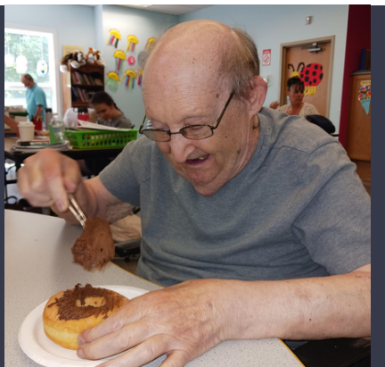
National Donut Day