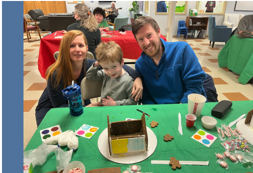
Building Gingerbread Houses

LARC's Autism Resource Center served children and teens with Autism Spectrum Disorder (ASD) and their families. The center provided free monthly webinars covering topics important to parents, educators, providers, and guardians. Two weekly playgroups for children aged 2-5 provided socialization and activities. Twelve families attended one or both playgroups each week.