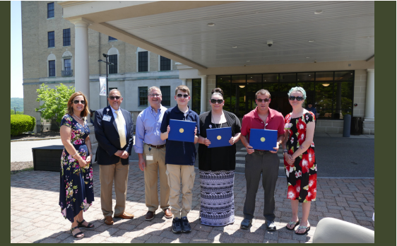
Graduation - June 2023

Thomaston Savings Bank has donated a 2019 Chrysler Pacific Touring L minivan to the agency's Project SEARCH program. As one of LARC's most generous supporters, Thomaston Savings Bank & Foundation continues to demonstrate their belief in the agency's mission and our vision for improving the lives of hundreds of individuals with intellectual and developmental disabilities. The minivan will have a profound impact as it will expand the reach of the program and add efficiency to the day-to-day activities of the Project SEARCH program.