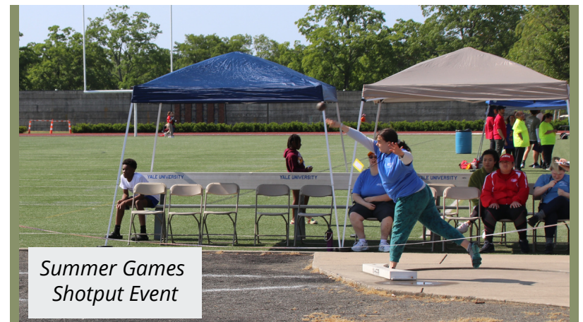
Summer Games Shotput Event

LARC's Special Olympics team consists of 64 athletes that compete in Bocce, Bowling, Alpine skiing, Cross Country skiing, Snowshoeing, Power Lifting and Track & Field.