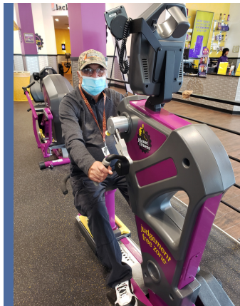
At the gym