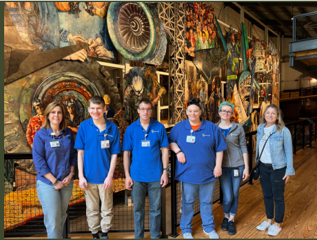
Visit to The Americal Mural Project