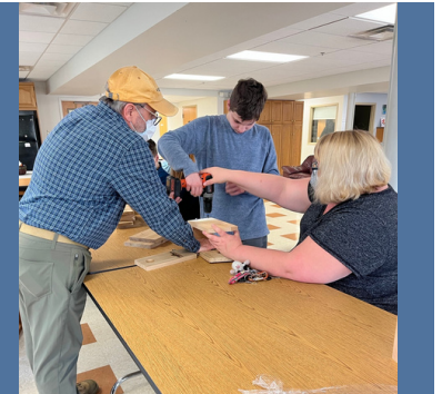
Birdhouse building with Flanders Nature Center