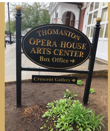
Theater tickets generously donated to a group of our residents.