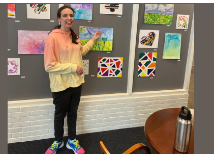
Art Workshop with Five Points Center for the Visual Arts