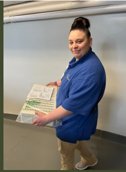
Interns at work